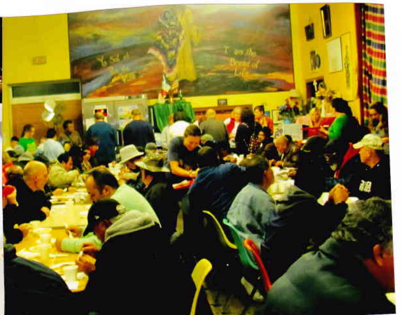
Thanksgiving Turkey Dinner Sharing God's blessings