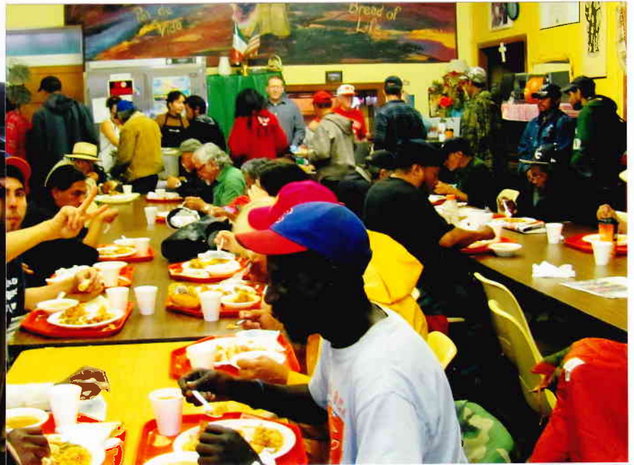
St. Matthew's Soup Kitchen, celebrates THANKSGIVING by sharing food with the hungry.